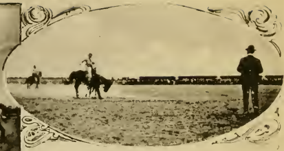
A HARD PITCHER.